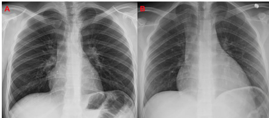
Figure 2. Chest radiographs on (A) initial presentation (within normal limits), and (B) on return visit 2 weeks later now demonstrating enlarged cardiac silhouette, consistent with large pericardial effusion.

carditis. Chest x-ray study, formal echocardiogram, and troponins were all within normal limits. After discussion with the Cardiology service, he was discharged on a regimen of ibuprofen 800 mg every 8 h, with a plan to follow-up with Cardiology as an outpatient. Three days later, his chest pain was persistent, and he was started on additional colchicine 0.6 mg daily.