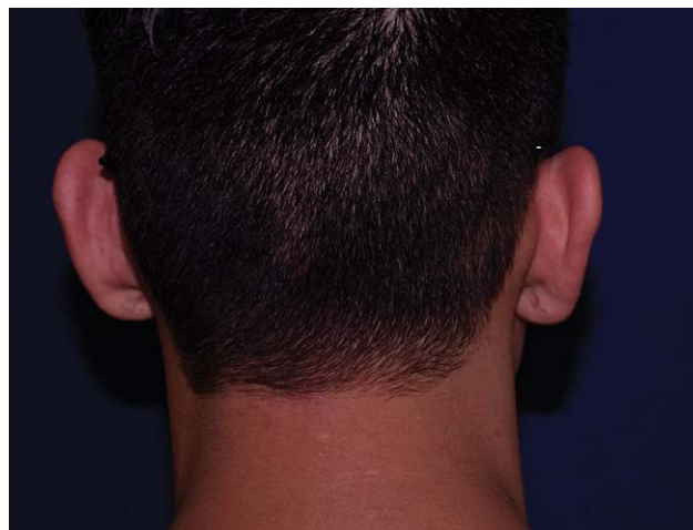
Fig. 4. Six months after two treatments of intralésional PRF.

AA is believed to be among the most common autoimmune conditions in humans, with an estimated lifetime risk of 1.7%–2.1%. 8 COVID-induced AA has emerged as a novel documented sequela of the virus in at least four other patients in two different studies, with one study noting the rapidly progressive nature and unresponsiveness to 1–2 months of topical, intralésional, and/or nutritional