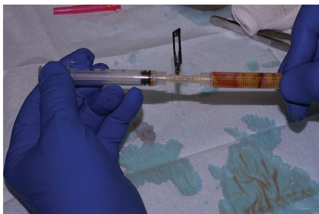
Fig. 1. Micronization of PRF into injectable form using a blade in a Luer-to-Luer connector.