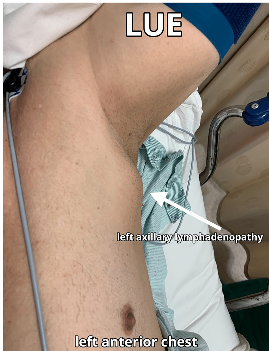
FIGURE 3: Final presentation of the LUE axillary swelling on 8/26/21, seven months after the second dose of the Pfizer-BioNTech COVID-19 vaccine

The left upper extremity is extended laterally with a blue blood pressure cuff around the patient's bicep and raised near his head with the arrow pointing to the area of swelling and the surgical site.