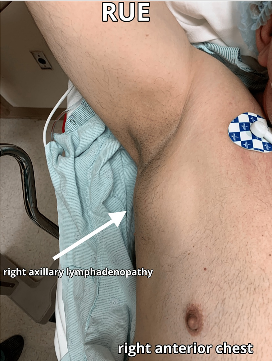
FIGURE 2: Final presentation of right axillary swelling on 8/26/21, seven months after the second dose of the Pfizer-BioNTech COVID-19 vaccine

The RUE is extended laterally, raised near the patient's head with the arrow pointing to the area of swelling.