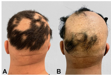
Fig 3. A 32-year-old man with moderate-to-severe alopecia areata ( A ) before (SALT 62%) and ( B ) 2 weeks after (SALT 70%) receiving the Moderna mRNA-1273 COVID-19 vaccine (first dose). SALT, Severity of Alopecia Tool.

no dose changes or treatment interruptions in JAKi systemic therapy or other medications were reported.