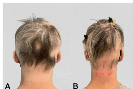
Fig 2. A 27-year-old man with moderate-to-severe alopecia areata (A) before (SALT 34%) and (B) 2 weeks after (SALT 59%) receiving the BioNTech/Pfizer BNT162b2 COVID-19 vaccine (second dose). SALT, Severity of Alopecia Tool.

50 at 3 weeks after testing positive, with subsequent shedding that lasted up to 16 weeks. This patient did not report significant weight loss, change in diet or nutritional deficiency, severe acute or chronic illness, infection, emotional stress, or trauma. Additionally,