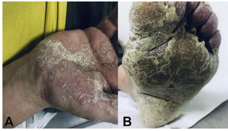
Fig 1. A , Hyperkeratotic papules and plaques with scales on erythematous background on both palms spreading to the wrists. B , The soles showed diffuse, thick, psoriasiform hyperkeratosis with fissures extending on the lateral borders.