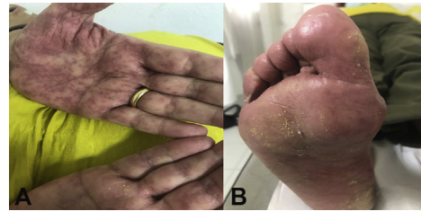
Fig 3. A , Complete clearing of the palmar lesions with residual hyperpigmentation after 1 month of therapy with acitretin. B , Clearing of the hyperkeratotic lesions of the soles with minimal residual xerosis after 1 month of therapy with acitretin.

Although LDE shows clinical and pathologic features similar to LP, its clinical presentation is sometimes more scaly, eczematous, and/or psoriasiform, resolving with greater residual hyperpigmentation, while histopathology may exhibit focal parakeratosis with interruption of the granular layer, a higher number of apoptotic keratinocytes, and eosinophils within inflammatory cells. 7 In our case, the clinical and histologic features were consistent with a diagnosis of LDE. Moreover, the development of a rare and atypical presentation of LDE, the temporal relationship, and the presence of eosinophils on skin biopsy are indicative of a pathogenic role of the COVID-19 vaccine in triggering the skin reaction, although skin tests were not performed. The validity of epicutaneous and intradermal testing to the Pfizer-BioNTech COVID-19 vaccines, however, has not yet been established. 9